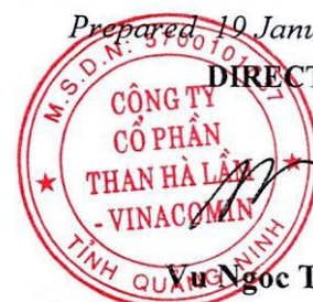
Vu Ngoc Thang